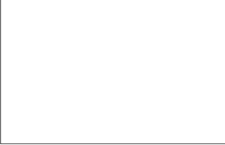
Figure 1 – growth potential

In fact, the confidence in India was such that the country was chosen as the third most competitive pharma business destination, with a score of 6.3, behind only the USA (6.9) and Germany (6.6), but ahead of Japan and China (see figure 2).