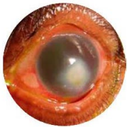
Cornea Scar – Opacity

One notable application of the therapy is in treating Keratoconus